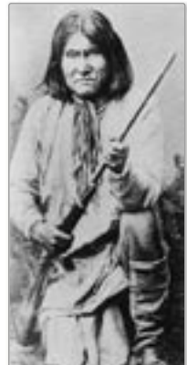
Geronimo 1829-1909 May He Rest in Peace

"Yeah? And my name is Moses," I thought to myself.