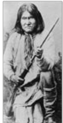
Geronimo 1829-1909 May He Rest in Peace

"Yeah? And my name is Moses," I thought to myself.